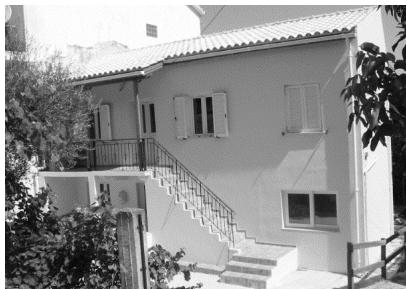
GAVRADES HOUSE , Near Dafni. In a peaceful hamlet 10 minutes from the beach, two bedroom cottage-style house, fully renovated with style. Garden front and back, pleasant country outlook, parking bay. 155,000 euro