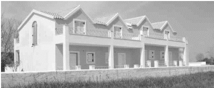
SPRING MEADOW HOUSES , Agnos. Four luxury houses, rural location near beach. Unique heated pool with Internet control. From 145,000 euro