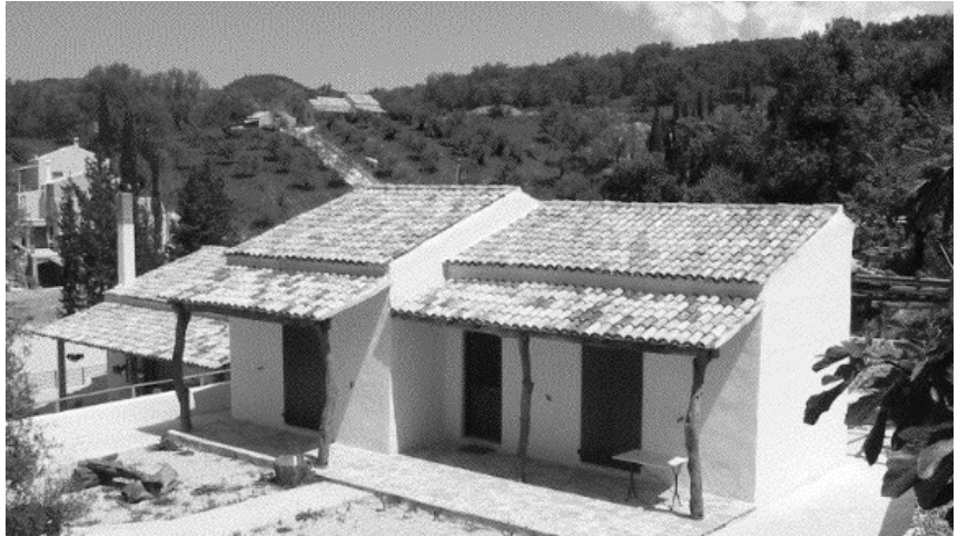
KATIKIA HOUSE , Arillas. Delightfully pretty resale mini-villa in rural 'hamlet' ten minutes walk to lovely beach. Traditional Corfiot aesthetics, up-to-date construction and installations. Two bedrooms, garden, parking, sunny location, country view. 150,000 euro ono