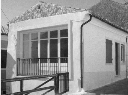
LYRA HOUSE , Ano Korakiana. Imaginatively restored two bedroom house with guest studio and roof terrace with sea view. 150,000 euro