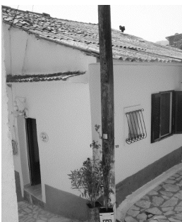
THE SPITAKI , Sinarades. Little one bedroom house, fully equipped and furnished, and decorated to high standard design. Papers ready. 60,000 euro