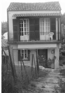
THE DOLL'S HOUSE , Afra. Three bedroom house, ready to occupy. Cosy cottage atmosphere. Covered yard, quiet edge-of-village location, parking and shop close. 80,000 euro