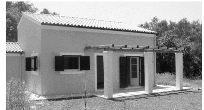
GOODGUY VILLA , Kouramades. Compact villa in peaceful rural setting. Two bedrooms, one on mezzanine. Excellent finishings, tasteful installations. 125,000 euro