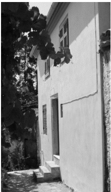
THEOTOKI COTTAGE , Doukades. Very pretty just-renovated one-bedroom cottage in a beautiful village near beach. Tavernas one minute walk. Sun terrace with view. Paperwork clear. 125,000 euro