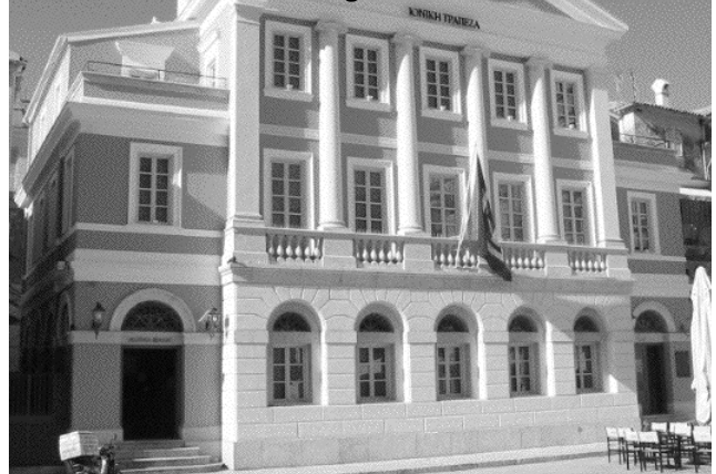
The Ionian Bank (Banknote Museum), one of the lovely buildings of the Old Town World Heritage Site

Fairmont's choice of Corfu for its latest project was influenced by the recent inclusion of the Old Town on the UNESCO's World Heritage List. Since 2006, Fairmont has been working in partnership with the World Heritage Alliance, a joint initiative of the United Nations Foundation and Expedia, Inc., to promote conservation, sustainable tourism, and economic development for communities located in and around World Heritage sites. It aims to preserve world treasures at the same time as enhancing visitors' experiences, by showcasing the destination's heritage and culture and cooperating with the local community to develop smart and sustainable business endeavors.